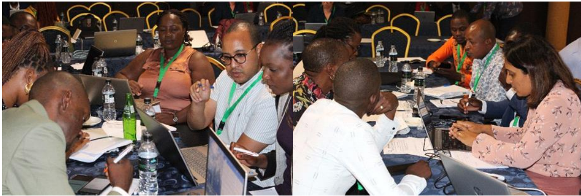
Group work during CLIMTAG workshop, Malawi October 2023

“delivering climate services for building climate resilience of the Agricultural sector in Africa using CLIMTAG”. Held in Lilongwe from October 09-11, 2024, the workshop aimed at enhancing the expertise of climate professionals and agricultural stakeholders in utilizing the CLIMTAG tool. CLIMTAG, the CLimate InforMation Tool for AGriculture provide to decision makers in the agricultural sector with operational climate information, for example about the start of the rainy season or the duration of a drought period. The web-based tool operates at country level and visualizes past, present and future actionable climate information, allowing its users to assess the severity of upcoming climatic changes, design robust national adaptation measures, or support applications for international climate finance.