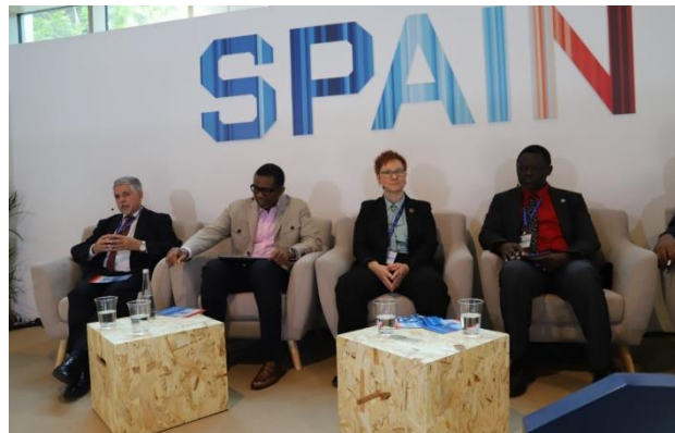
Interesting discussion on international cooperation for strengthening climatological infrastructure and services at Spain pavilion

The ongoing discussion delves into advanced Climate Services, emphasizing knowledge-driven decision-making & resilience. The focus on work by various institutions implementing Intra ACP highlights the significance of climate information dissemination to end users.