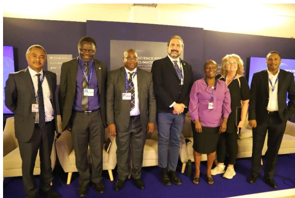
The side event on Early warning for all with partners (CIMA, NORCAP, UNDRR, ICPAC, WMO, and MALAWI Met)